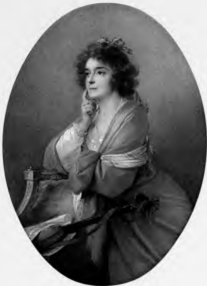
FÜRSTIN ANNA LIECHTENSTEIN-KHEVENHÜLLER BY HEINRICH FRIEDRICH FÜGER (CIRCA 1795)